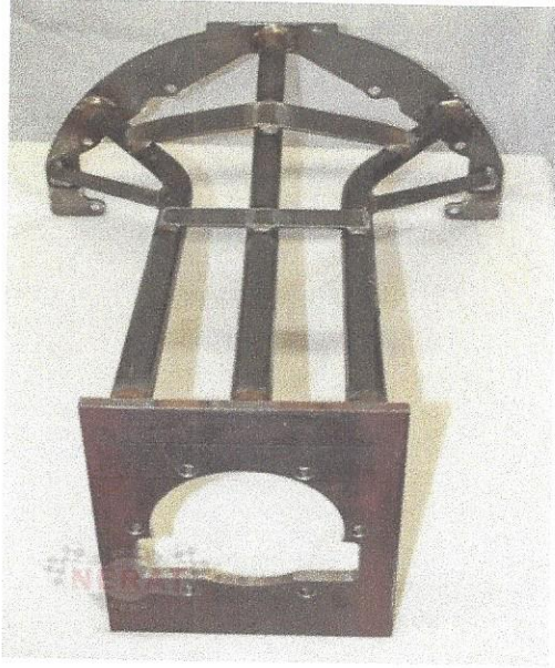
Example of trans braces allowed.