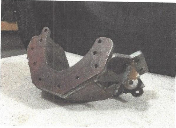
Example for type of cradle allowed and pulley protector.